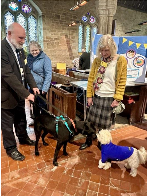
Dogs chatting about the heritage!

Rt Rev Philip Mounstephen, Bishop of Winchester (Bishop of Truro until Sept 2023). said: 'I am delighted by what you've done at St Sampson's and am inspired by your energy, commitment and passion – it stands as such a wonderful example to others of just what is possible' .