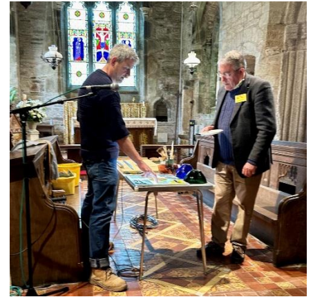
Demonstrating stained glass restoration techniques

We are excited for the future as we move into the next phase.