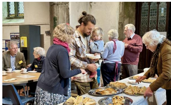
Plenty of conversation over good food